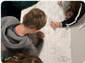
Students work together on a giant Adventskalender to count down the days until Weihnachten.