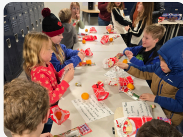
Friends gather together to see what St. Nikolaus brought them. They enjoyed their treats and hot chocolate.