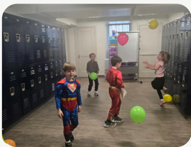
Students were immediately drawn to the balloons and created their own game.